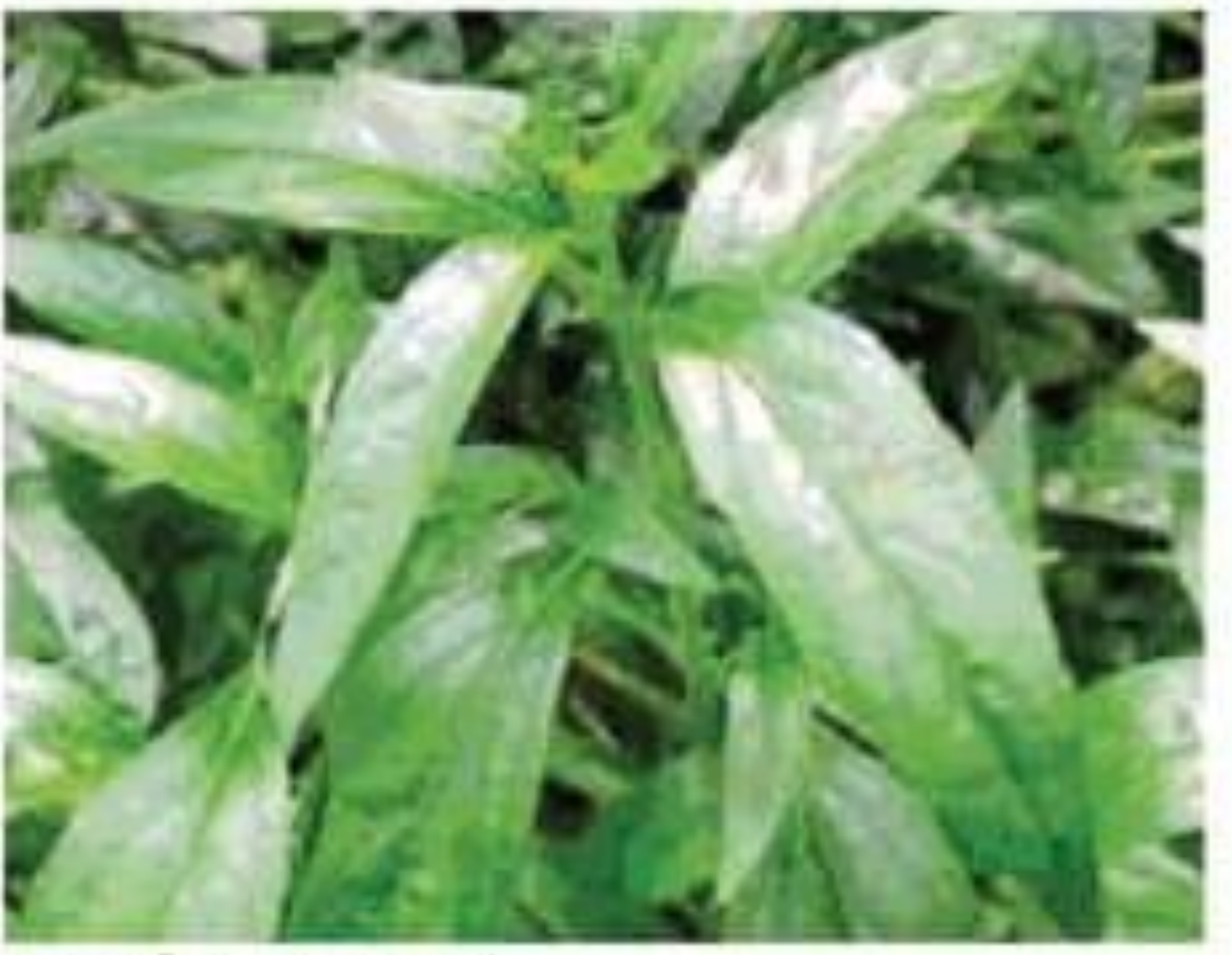
कालमेंघ का पौधा