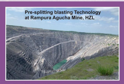
Implementation of pre-split blasting technology at Rampura Agucha Mine of Hindustan Zinc Limited.