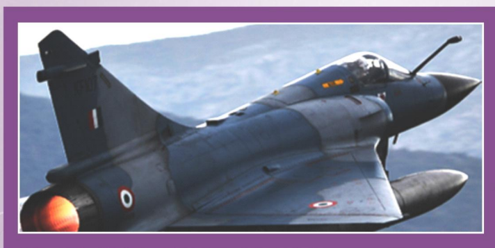
Front line Aircrafts Upgrades: Structural Integrity, Stability, Control and Aero-Mechanical Clearance of New Stores by CSIR-NAL

(CSIR Technology Award for Physical Sciences Including Engineering-2019)