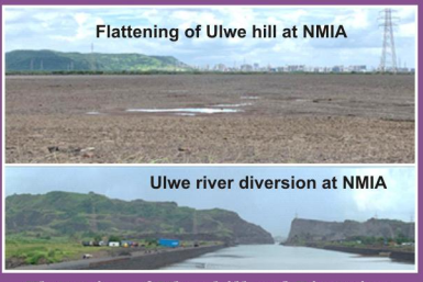
Flattening of Ulwe hill and Diversion of Ulwe river by Controlled Blasting Techniques implemented for construction of Navi Mumbai International Airport (NMIA) site.

(CSIR Technology Award for Physical Sciences Including Engineering-2019)